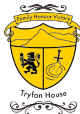
Tryfan (T) House colour: Yellow

When pupils arrive at St David's they are placed into one of the three houses and given a House number (e.g. C102); this is used mostly to help identify clothing and belongings, especially when pupils have similar names. Siblings are placed in the same houses.