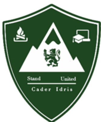
Cader Idris (C) House colour: Green

The pastoral care of pupils is a key element to the success of St David's College. The three houses are named after the mountains and hills in Wales and have their own House colours: