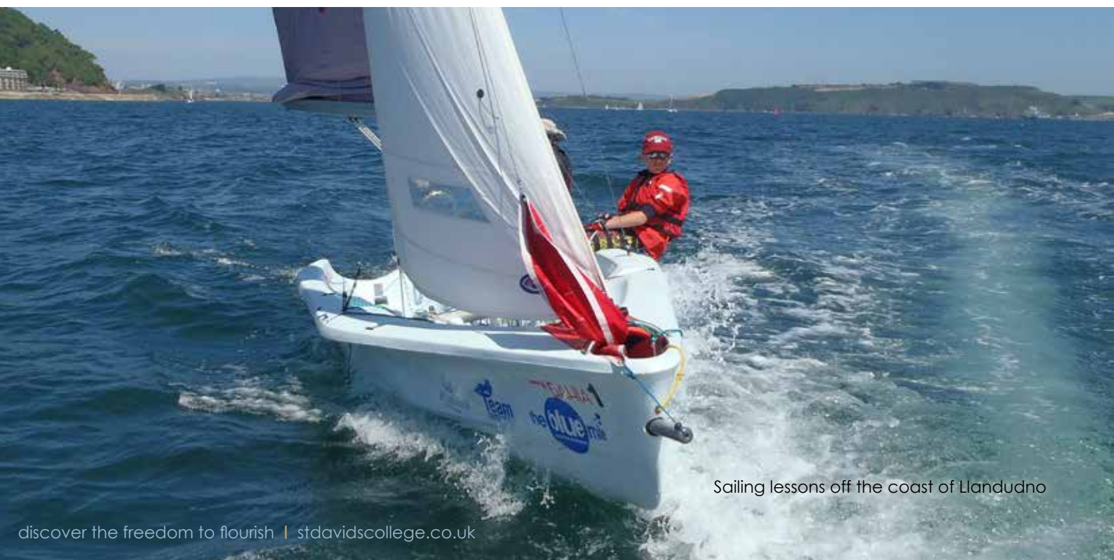
Sailing lessons off the coast of Llandudno

All members of the Outdoor Education staff will be happy to offer advice on clothing or equipment if required. All necessary equipment can be purchased through any outdoor equipment retailer.